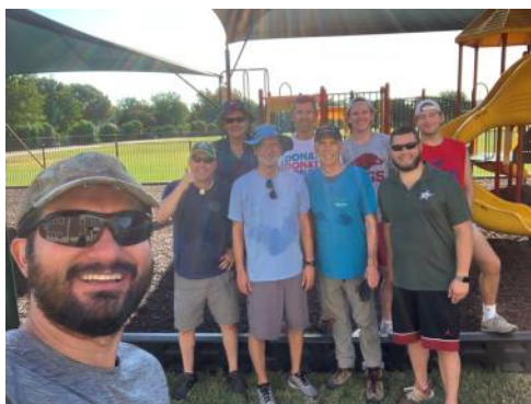
Messiah Lamb's Service Project – Men's Ministry

If you would like more information about our Social Ministries & Outreach programs or Lutherans for Life and the opportunities, we have to Share God's Light, I can be reached at dawnmj@fastmail.net .