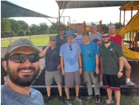
Messiah Lamb's Service Project – Men's Ministry

This is an low-pact, slow-motion exercise with movements usually circular and never forced, the muscles are relaxed rather than tensed, the joints are not fully extended and bent.