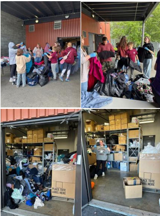
Alaska Mission Team serves Catholic Social Services - Brother Francis Shelter - we organized donations in their storage. It was packed to the gills. Thank you for supporting your youth!

As youth ministry is growing we need more adult help with youth activities/events. Please prayerfully consider serving in this growing and fun ministry!