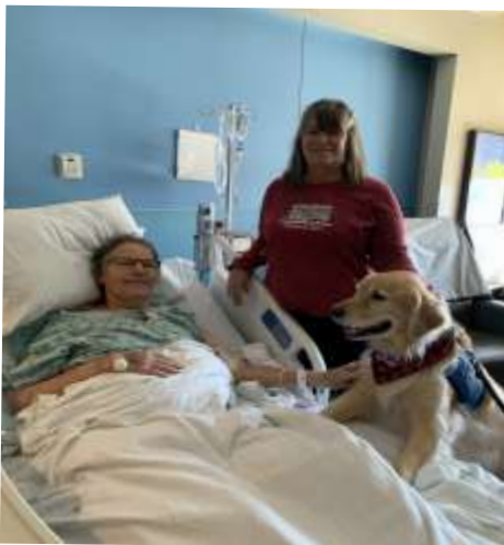
Visiting Messiah Member