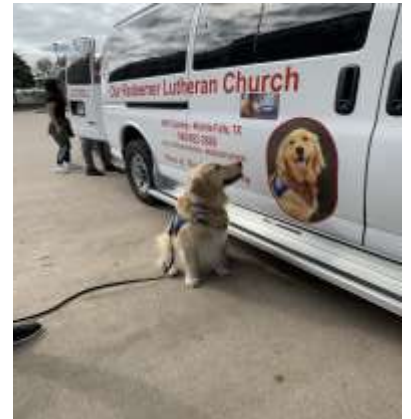
Finding Old Friends