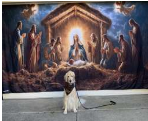
A Savior! John 3:16