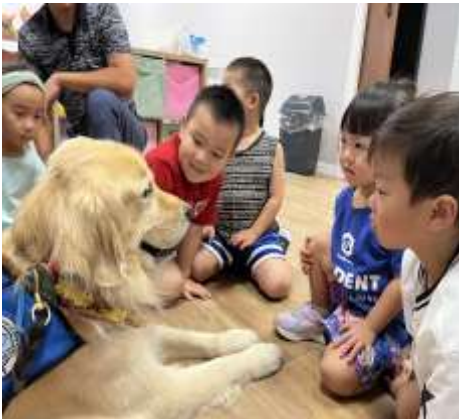
Sharing Smiles with Littles