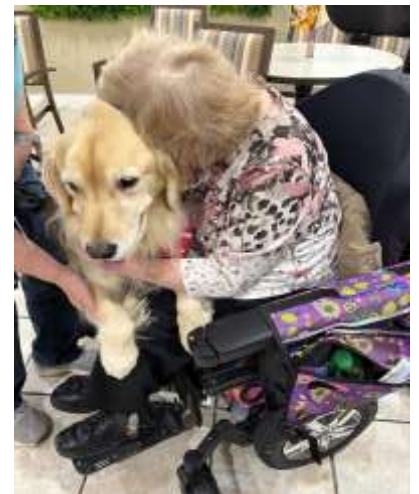
Sharing a Hug